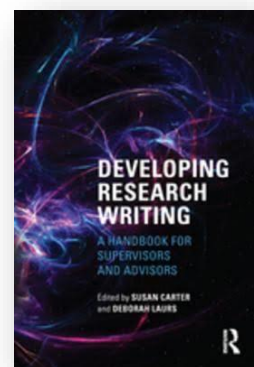
Developing Research Writing: A Handbook for Supervisors and Advisors (Routledge, 2018)