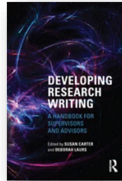
Developing Research Writing: A Handbook for Supervisors and Advisors (Routledge, 2017)